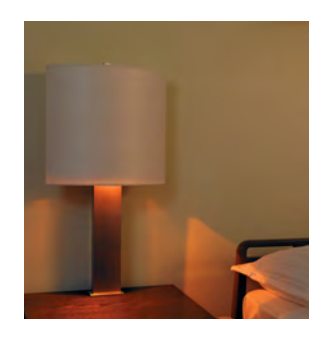
Night Light (NGT) Option