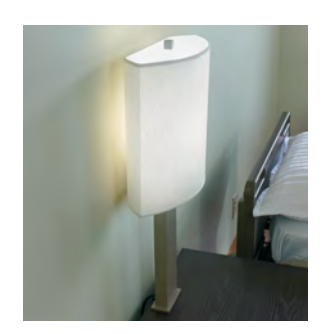
Space Saving Flat-back Shade, White Tri-lam Vinyl (FBWHT) Top Lens (TL) option